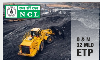
Northern Coal Fields, Bina Project - ETP, Capacity - 32 MLD

Biggest O & M Contract at L & T Ludhiana 40 MLD