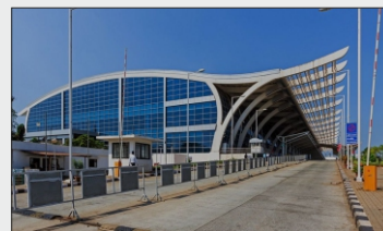
Goa Airport Location, Goa Project - STP, Capacity - 600 KLD