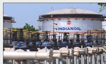
IIPM, Delhi Project - STP, Capacity-80KLD