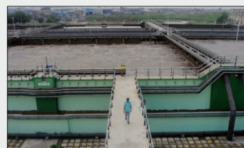
L & T, Ludhiana Project - CETP, Capacity - 40 MLD