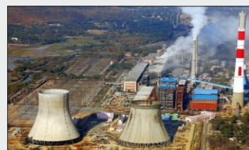
Thermal Power Plant, Sarni Project - STP, Capacity - 2.6MLD