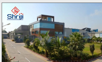
Shriji Polymers India Ltd., Ujjain Project - WTP, Capacity - 100KLD