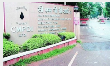
Central Hospital Coal India, Ranchi Project - ETP, Capacity - 35KLD