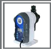
Automatic Chemical Dosing Pump