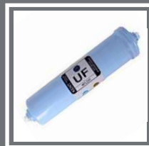
Ultra Filtration Membrane