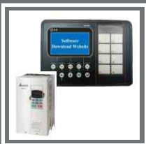
VFD and PLC System