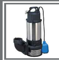
Sewage Grade Pump Crompton/Kirloskar