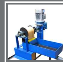
Belt Type Oil Skimmer with Crompton Motor