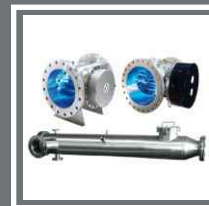
Ultra-Violet Disinfection System