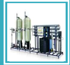
Industrial RO Purifier