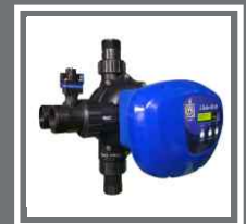
Automatic Multiport Valve