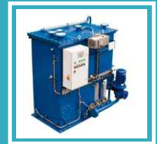
Compact Sewage Treatment Plant