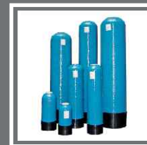
Filter Vessels Pentair